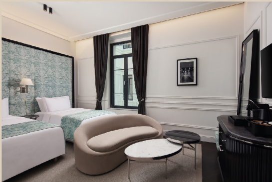
Deluxe Twin Guestroom