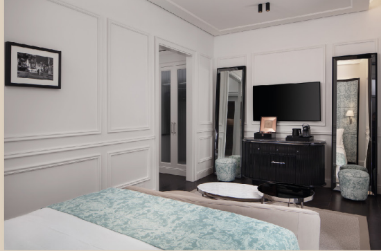
Deluxe King Guestroom