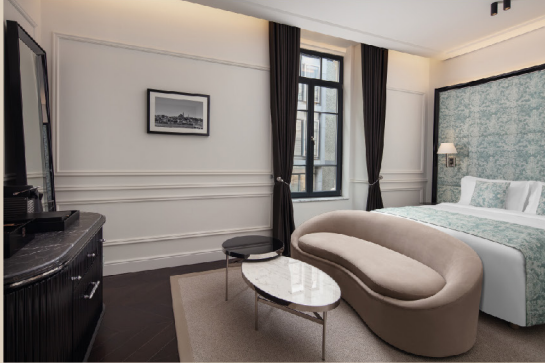
Deluxe Queen Guestroom