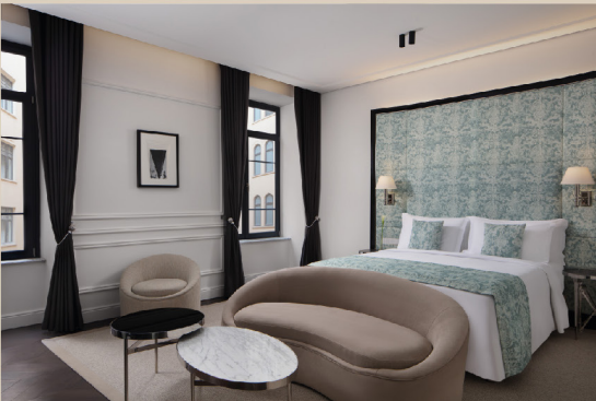
Sanasaryan Han Suite Bedroom