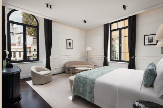
The Charm Corner Room