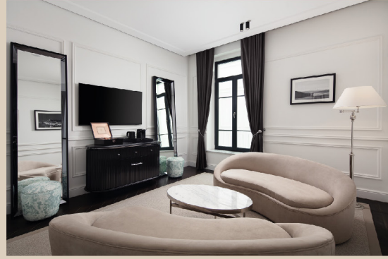
Sanasaryan Han Suite Living Room